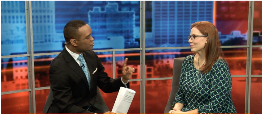
HIGHLIGHTING THE GOOD MOMENTS ON SOCIAL MEDIA

You're just one social media strategy away from raving fans!